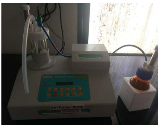
Figure 5: Experimental setup for Water Content test as per ASTM D6 304 standards