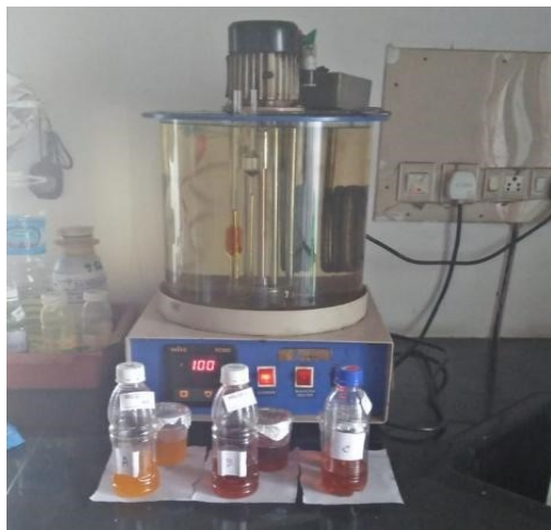
Figure 3: Experimental setup for Kinematic Viscosity test as per IS:1448 (Part-25) standards.