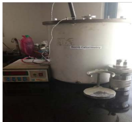
Figure 6: Experimental setup for sulphur content test as per IS:1448 (Part-33) standards.