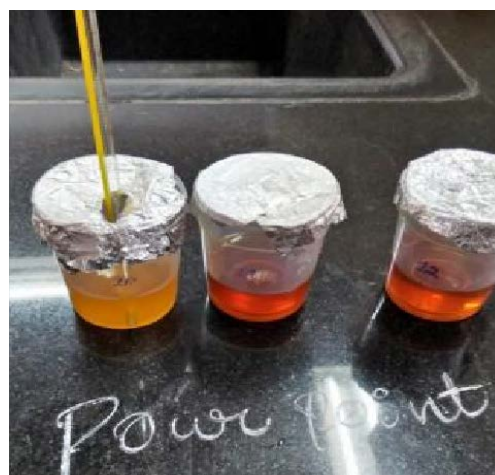
Figure 4: Experimental setup for Pour Point test as per IS: 1448 (Part-10) standards.