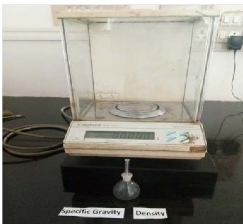
Figure 1: Experimental setup for density test as per IS:1448 (Part 16) standards.