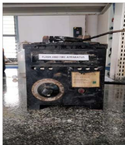
Figure 2: Experimental setup for Flash and Fire Point test as per IS:1448 (Part 66) standards.